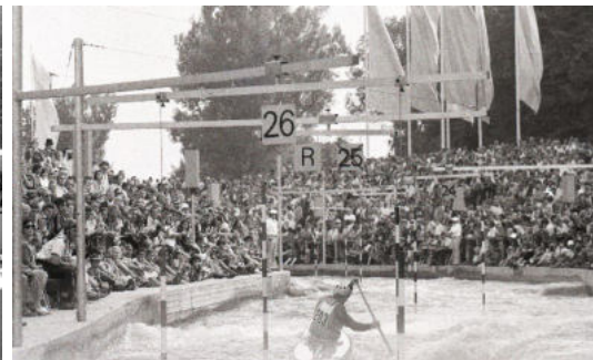
Olympic Games Munich 1972 – Canoe Slalom - Augsburg Eiskanal