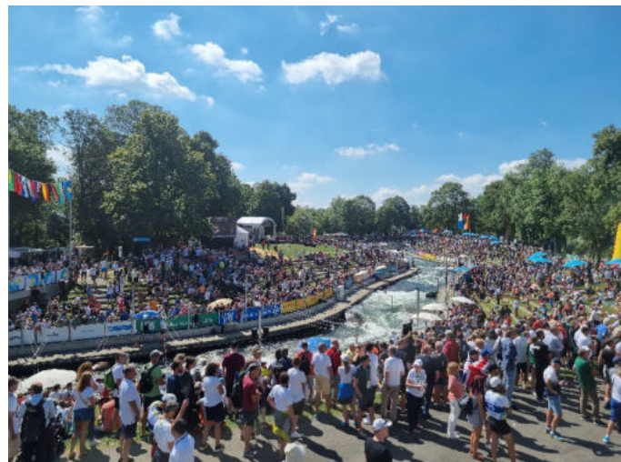
right: World Championships 2023 top: German Championship 2023